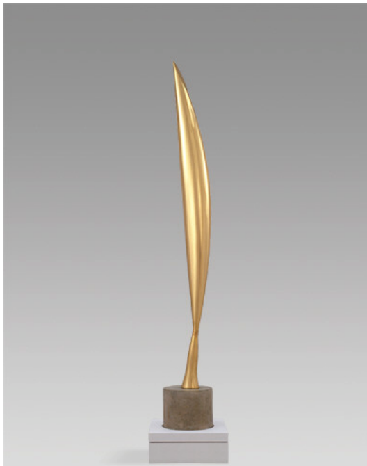
Fig. 1: Bird In Space (ca. 1932)

http://www.guggenheim.org/new-york/collections/collection-online/show-full/piece/?search=Bird%20in%20Space&page=&f=Title&object=76.2553.51