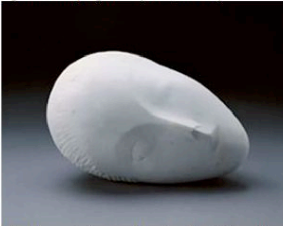
Figure 1: Sleeping Muse (1909, marble)

http://www.tate.org.uk/modern/exhibitions/brancusi/