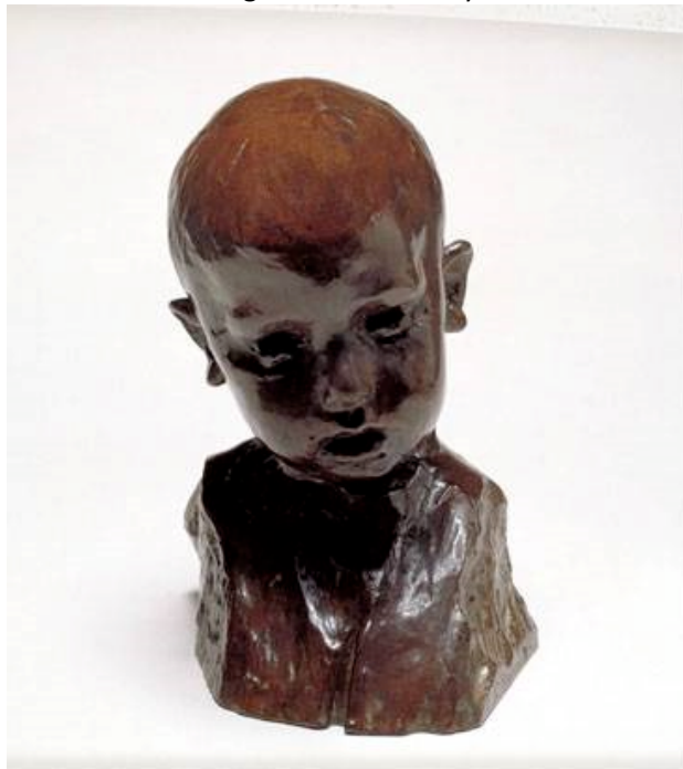
Fig. 2: Bust of a boy

http://robinrile.com/blog/?tag=auguste-rodin