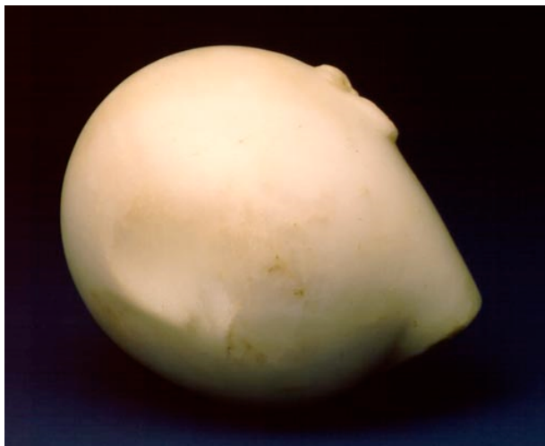
Figure 3: Prometheus (1911, marble)

http://www.tate.org.uk/servlet/ViewWork?cgroupid=999999961&workid=1430&searchid=9966&tabview=image